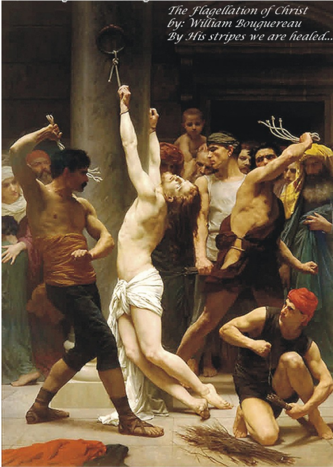
The Flagellation of Christ by: William Bouguereau By His stripes we are healed...