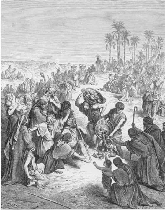
CHRIST FEEDING THE MULTITUDE

And they say unto him, We have here but five loaves, and two fishes. He said, Bring them hither to me... (Matthew 14: 17, 18)