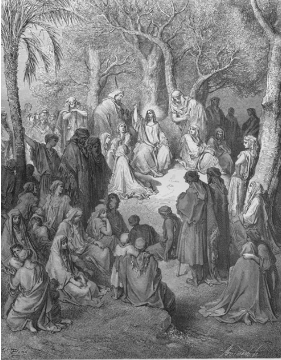
THE SERMON ON THE MOUNT

Consider the lilies of the field, how they grow; they toil not, neither do they spin; And yet I say unto you, That even Solomon in all his glory was not arrayed like one of these... (Matthew 6: 28, 29)