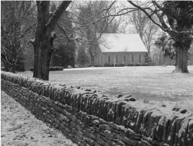
Pisgah Presbyterian Church – Versailles, KY – est. 1784