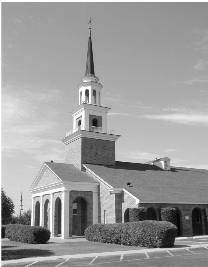
Northminster Presbyterian Church – Tucson, Arizona