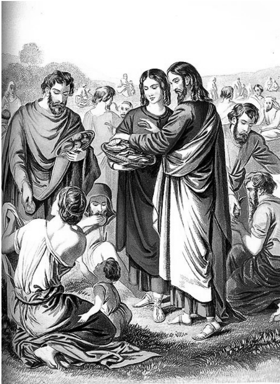
Christ Feedeth The Multitude