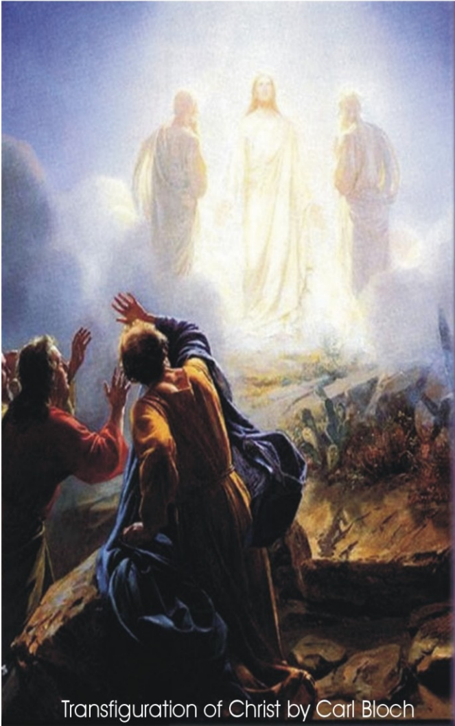
Transfiguration of Christ by Carl Bloch