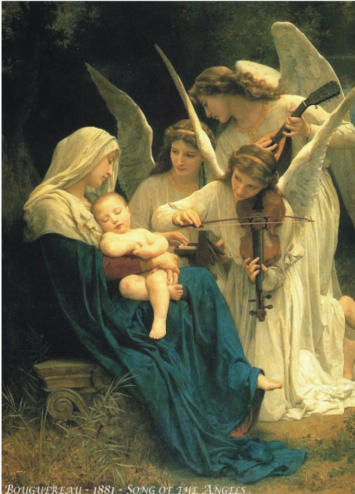
BOUGUEREAU - 1881 - SONG OF THE ANGELS