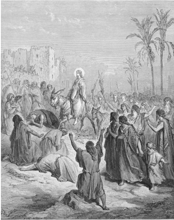
ENTRY OF JESUS INTO JERUSALEM

And the multitudes that went before, and that followed, cried, saying, Hosanna to the Son of David: Blessed is he that cometh in the name of the Lord... (Matthew 21: 9)